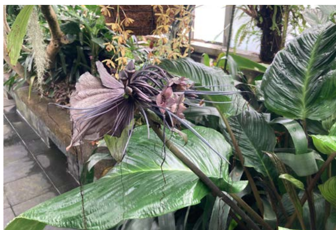
Bat plant in the Begonia House.

Finally don't forget to enjoy an evening walk through the Garden before winter creeps in without us noticing. The rose garden is punching well above its weight in this hot weather and there are a number of interesting and unusual flowers in the Begonia House including the Bat plant. Interesting on so many levels.