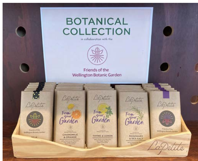
La Petite Chocolatier and Friends of the Wellington Botanic Garden Chocolate fundraiser. Available in the Treehouse, and at La Petite on Tinakori Road.

Closer to home, don't forget to have a walk around the new children's play area – opened in early March. Make sure you stop and admire the sleek design of the Friends solar seat. It is a modern example of a multi-functional piece of furniture. Not only is the stylish seat a good place to rest and warm your nether regions, it is connected via Bluetooth to the Council free WIFI