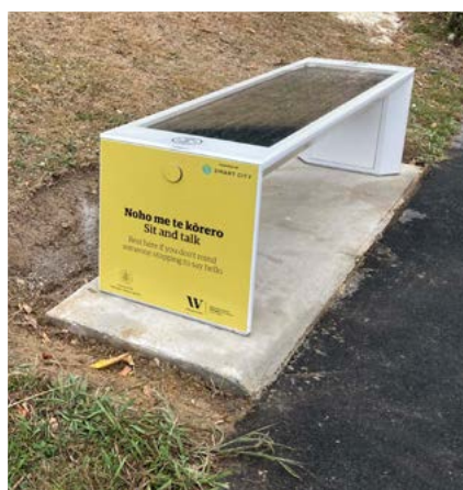
Friends new Solar powered seat.

If you would like to share your photos with the Friends and visitors to the Garden please email mmainwaring@xtra.co.nz